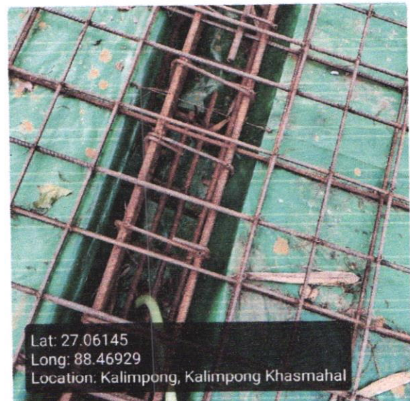
Roof Beam Mid Span Top Support Image