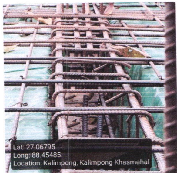
Roof Beam Mid Span Top Support Image