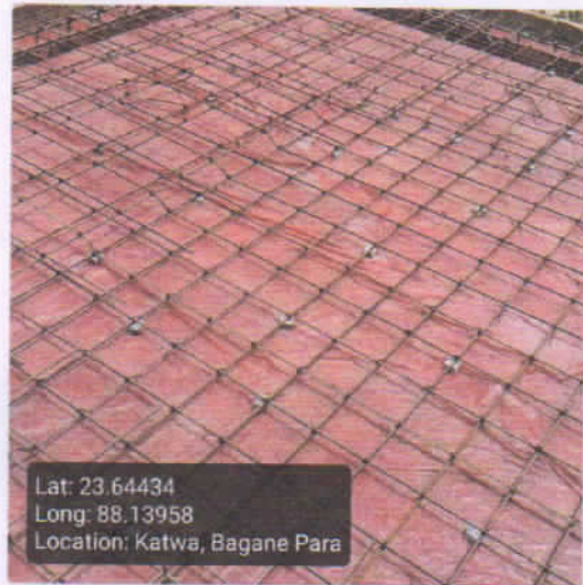
Binder for Roof Beam Support (250mm X 250mm)