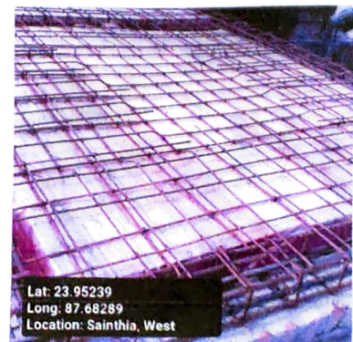
Roof Details Parameters Image