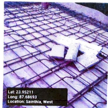
Roof Details Parameters Image