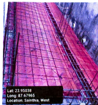
Roof Details Parameters Image