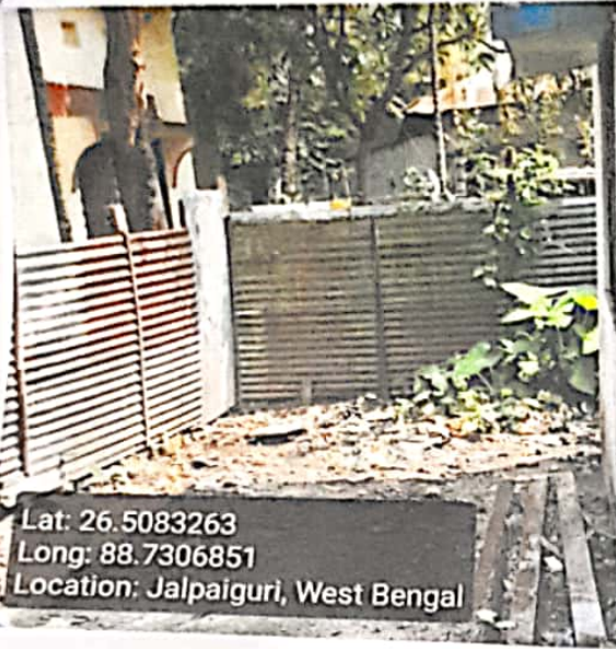
Lat: 26.5083263 Long: 88.7306851 Location: Jalpaiguri, West Bengal