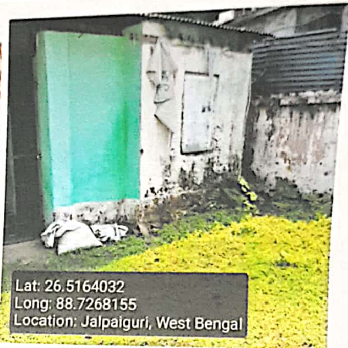
Lat: 26.5164032 Long: 88.7268155 Location: Jalpaiguri, West Bengal